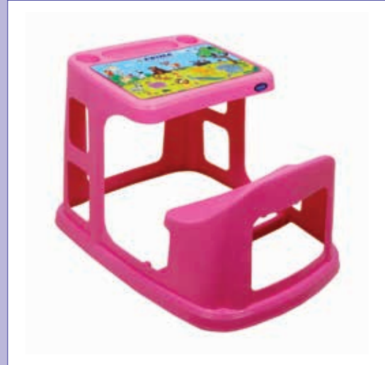
KIDS STUDY TABLE